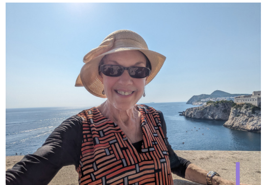
Beautiful Croatia: refreshment and prayer space

On a more local basis, I have become involved in joining a bring-and-share lunch in Barnet for single, isolated local people on Sundays.