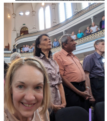
Photos from top to bottom: Ireland pilgrimage; sailing Saint Columba's Way; Eden and the lost gardens of Heligan, Cornwall refreshment weekend; 40th anniversary for CARE